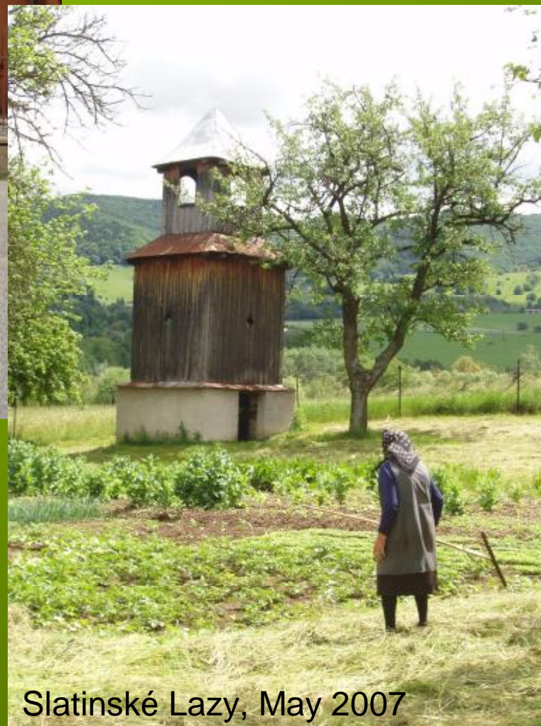
Slatinské Lazy, May 2007