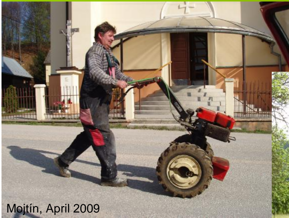
Mojtín, April 2009